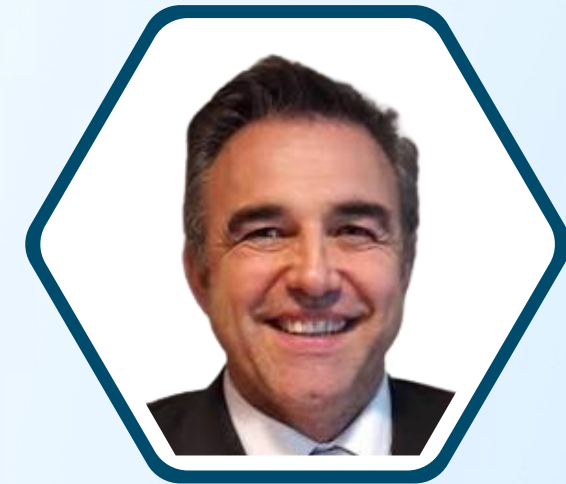
Hervé POULMAR Optibelt